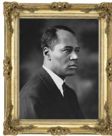
CHARLES H. HOUSTON

Houston died at the age of 54 before racial segregation was ended. However, Marshall picked up the torch and carried it forward, orchestrating his crowning achievement, Brown v. Board of Education . Later, Marshall became the first African-American appointed to the Supreme Court of the United States. Marshall acknowledged the work of his mentor that allowed him his subsequent successes stating “we wouldn’t have been any place” if “Charlie [Houston] hadn’t laid the groundwork for it.”